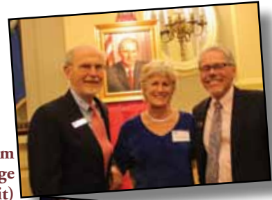
Malcolm Baldrige (portrait)

This scholarship fund was established by Post University when it named the school of business after former Secretary of Commerce and Connecticut businessman, Malcolm Baldrige. In keeping with the Baldrige legacy, the scholarship will be awarded to students at the Post Business School, which is committed to creating a community of best practices focused on continuous learning and business excellence.