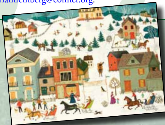
Noted Woodbury folk artist leaves estate gift to establish Fund to support health issues