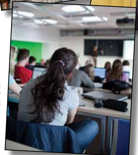
Hal McCauley Fund

The trustees of the Hal McCauley Memorial Fund established this designated fund to provide annual support to the Sherman Higher Education Fund, which is dedicated to helping young people and adults, who reside in Sherman, in their pursuit of higher education by providing financial assistance through grants and loans.