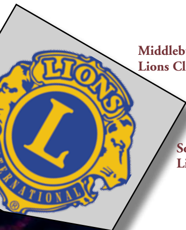
Middlebury Lions Club